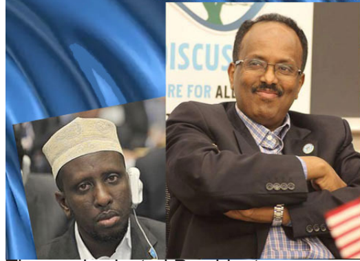
President Mohamed Abdullahi "Farmajo"